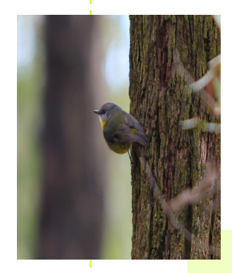
Eastern yellow robin