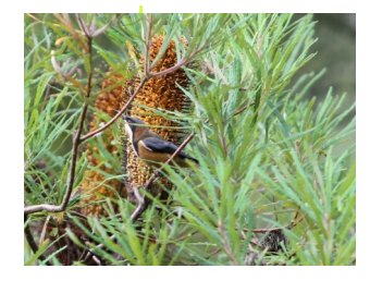
Eastern spinebill honeyeater